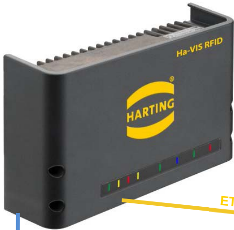
HARTING Ha-VIS RF-R500 RFID Reader

INTACS Industrial Training incorporates RFID for an industrial solution in a Hi-Bay Warehouse