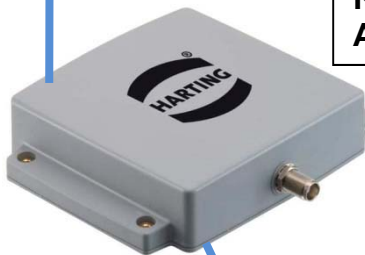
HARTING Ha-VIS RF-ANT-MR20 Antenna